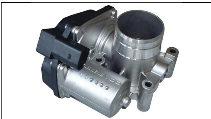
1 - Produkt / Product